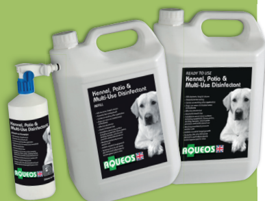
1 Litre | 5 Litre | 5 Litre