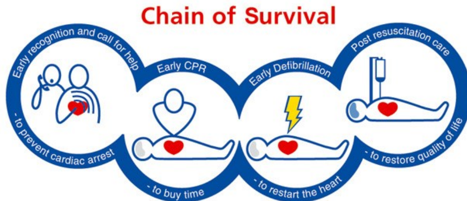
Figure 1. The Chain of Survival

www.resus.org.uk/resuscitation-guidelines/adult-advanced-life-support/ www.resus.org.uk/resuscitation-guidelines/post-resuscitation-care/